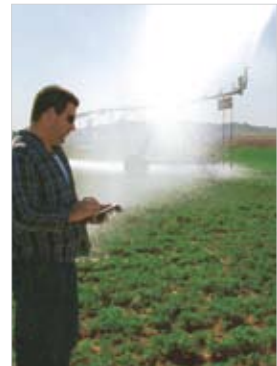
Remote end-guns are adjusted with Bluetooth® PDA

For more information, visit www.zimmatic.com or talk to your Zimmatic dealer.