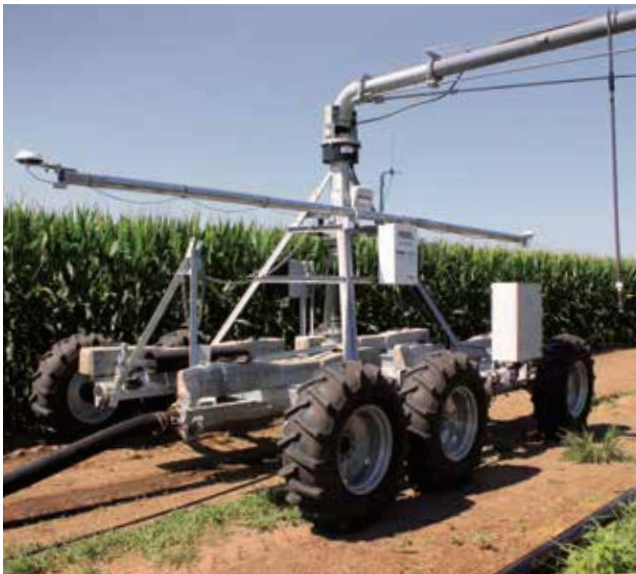
6-WHEEL HIGH TRACTION PLATFORM