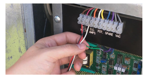
Step 8: Locate the Red, Black, White, and Green wires from the signal cable. Connect the Red wire to the Rectifier positive output and the Black wire to the Rectifier negative output using the ring or fork connectors provided. Connect the White wire to the Shunt positive output and the Green wire to the Shunt negative output with the fork connectors provided.

Step 7: Attach the AC Detect Probe to the live leg of the incoming commercial power with 2 small cable ties. For 240V incoming power, attach the probe to only 1 of the 2 live wires. Locate the Orange and Blue wires in the signal cable from the Scout unit and butt splice them to the wires from the AC Detect Probe (Orange to Red and Blue to Black).