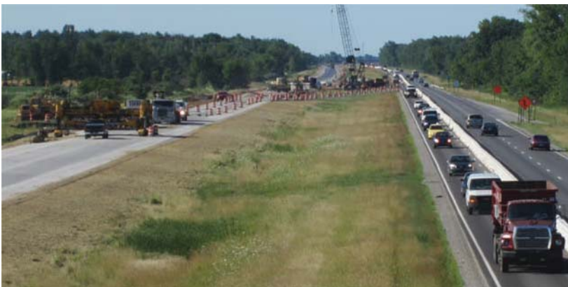
Traffic is crossed over and Moveable Barrier creates a 1/2, 2/1 configuration