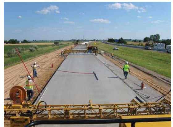
Accelerated construction and better quality repairs