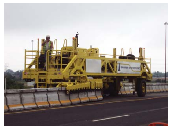
INDOT saved $1.2 million in construction costs