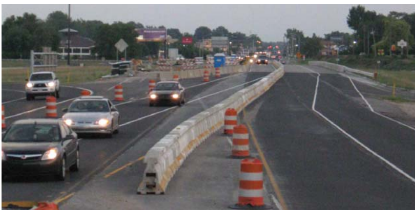
Moveable Barrier separates traffic with positive protection on US 31, IN

Because the bridge no longer had to be widened, the estimated project cost was revised to $4.8 million, which was $1.2 million in savings over the original estimate. In addition to the cost savings, the moveable barrier provided benefits to motorists by maintaining the same number of traffic lanes throughout the entire project, and the surrounding neighborhoods benefited from the reduced impact to air quality that is typically created from traffic backups. The project exceeded INDOT's original expectations in several categories including overall project cost and potential impact on the motoring public, and it received an ACEC Honor Award in Indiana.