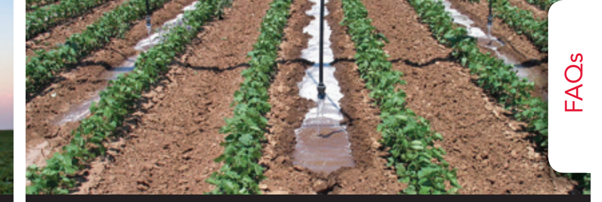
LOW ENERGY PRECISION APPLICATION (LEPA)