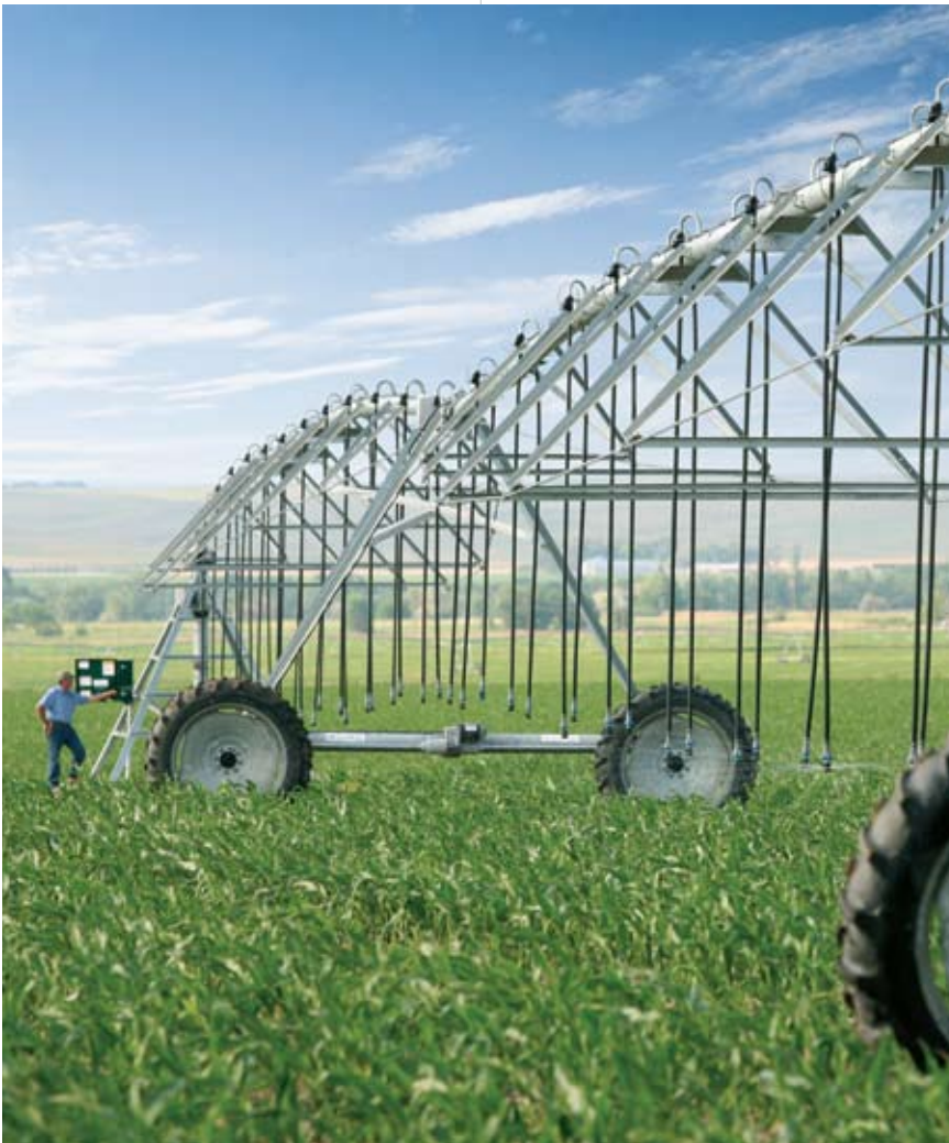
Systems and sprinklers are designed to meet your specific field and local climatic conditions.