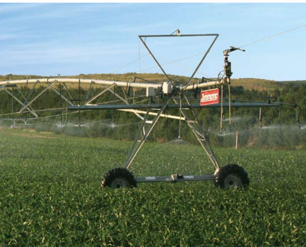
From a wide range of tower structure heights to customized sprinkler packages, Lindsay irrigation systems are designed for optimum efficiency.