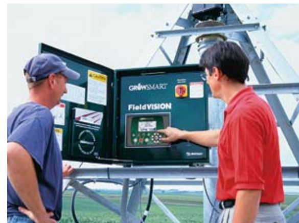
User-friendly controls are customizable for your operation.