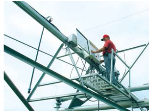
Trained dealers provide annual checkups, seasonal maintenance and service when necessary.