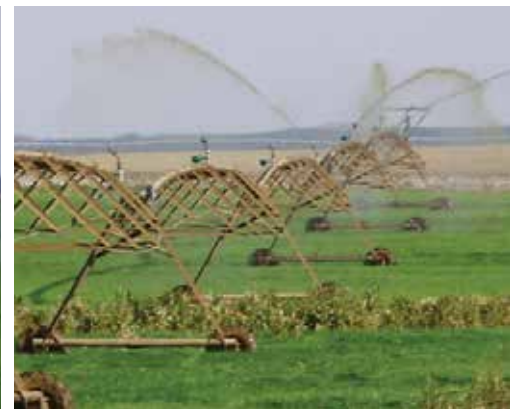
Highbrighton/Barrington Dairies recently faced a challenge of having to avoid applying effluent near a drainage ditch and buffer area. As shown here, the sprinkler guns on the Highbrighton/Barrington pivot turn off as they approach the drainage ditch.