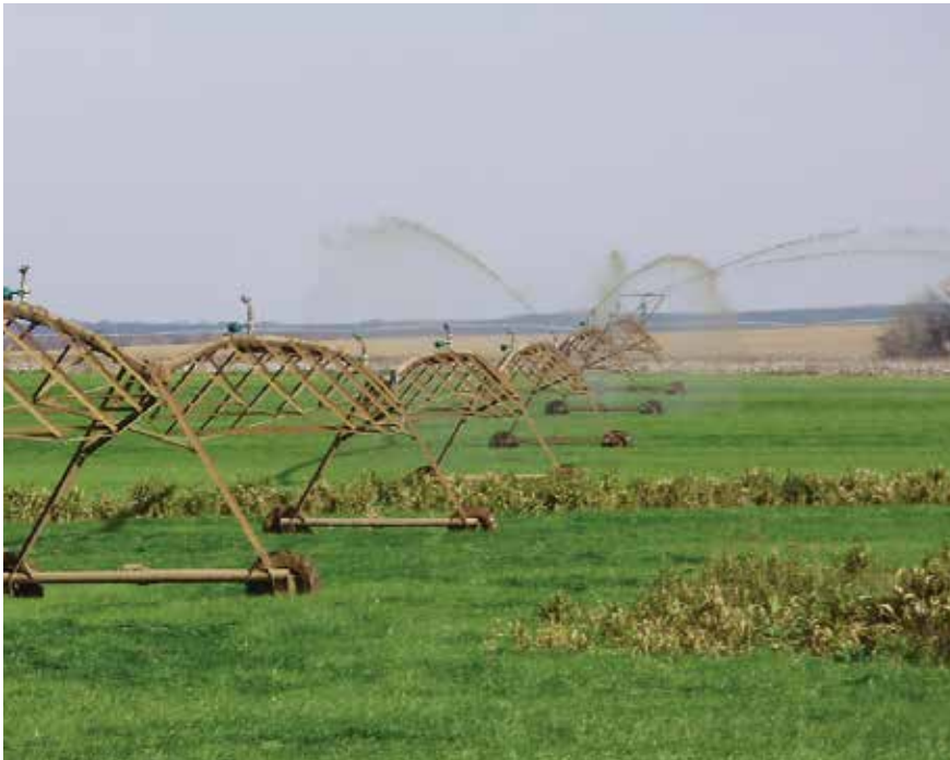
Highbrighton/Barrington Dairy wastewater effluent being applied to the field via Precision VRI – zone control irrigation.

WITH PRECISION VRI – ZONE CONTROL IRRIGATION