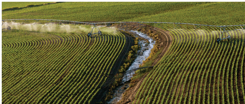
Precision VRI can provide individual sprinkler control as shown in the top photo from Kangaringa Station, or zone control as shown in the bottom photo from Nebraska.