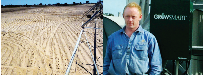
A combination of sand and clay soils caused water to puddle and damage crops.